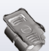
• Wearable Holder